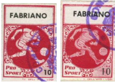
T1 '10' T2 '10' city and value in black

city and value in black Urgenza 22 x 32.5 mm roulette 20 Lire bright purple 11/1959 3/63 2.00