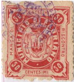
Marco Riscontro 26.5 x 30 mm 50 Cent. red