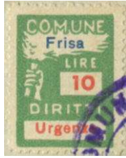
1 st Type