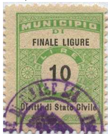
city, usage and value in black 22.5 x 29 mm P10 10 Lire yellow green 2.00