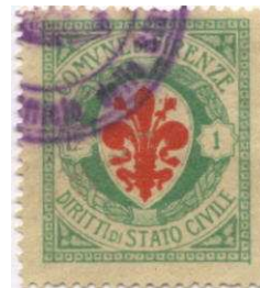
center in dark red (shades)

Segreteria 24.5 x 29 mm P11.5 10 Cmi olive green 2.00 20 Cmi gray 2.00 orange fleur de lys 2.00 25 Cmi dark blue 3/1926 2.00 50 Cmi red brown 3/1926 2.00