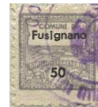
city and value in black