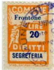
2 nd Type