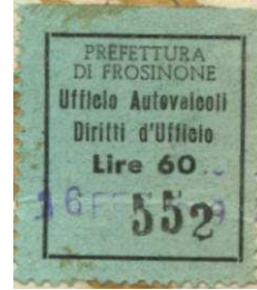
black on colored paper