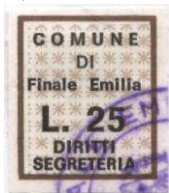
black inscriptions 17.5 x 21.5 mm roulette 25 L. brown 2.00