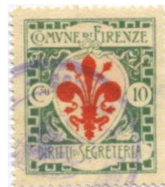
center in dark red (shades)

Segreteria 24.5 x 29 mm P11.5 10 Cmi olive green 2.00 20 Cmi gray 2.00 orange fleur de lys 2.00 25 Cmi dark blue 3/1926 2.00 50 Cmi red brown 3/1926 2.00