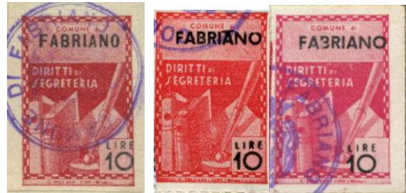
T1 T2 T3