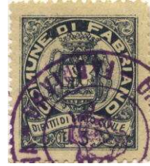
Segreteria 22 x 25 mm 0,80 L. dull blue 4/1941 2.00