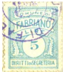
Segreteria 21 x 26 mm 5 Lire greenish blue 3/1948 4/48 2.00