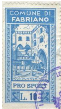
T1 large '10' 'Pro Sport'

Pro Sport 22.5 x 32.5 mm roulette 10 Lire red T1 12/1958 3/59 3.00 10 Lire red T2 11/1959 7/61 2.00