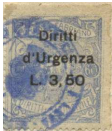
surcharged in black