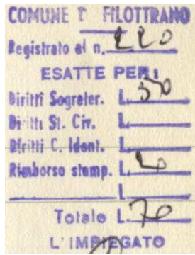
34 x 45 mm purple 1/1967 6.00