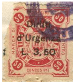
surcharged in black