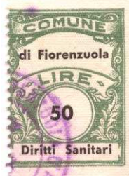
city, usage and value in black 23 x 29 mm P11.5 50 Lire green 2.00

Segreteria 23 x 29 mm P11.5 50 Lire orange 7/1965 2.00 50 Lire red orange 1/1970 2.00