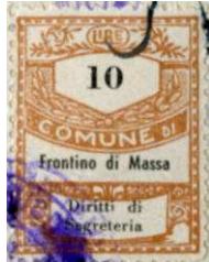
city, usage and value in black