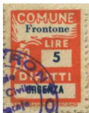
2 nd Type