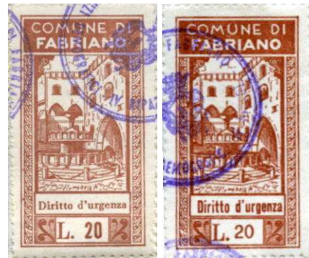
T1 '20' T2 '20'

Segreteria 23 x 43 mm P11 25 L. dark blue green 12/63 10/70 2.00