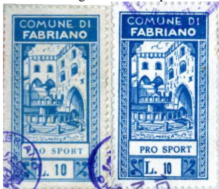
T2 "Pro Sport" T3

Pro Sport 23 x 43 mm P11 10 L. blue T1 12/1963 10/682.00 10 L. blue T2 1/1964 4.00 10 L. blue T3 3/1970 4/70 3.00