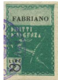
city and value in black